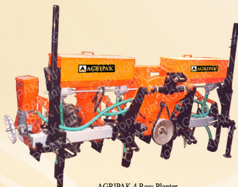
AGRIPAK 4 Row Planter